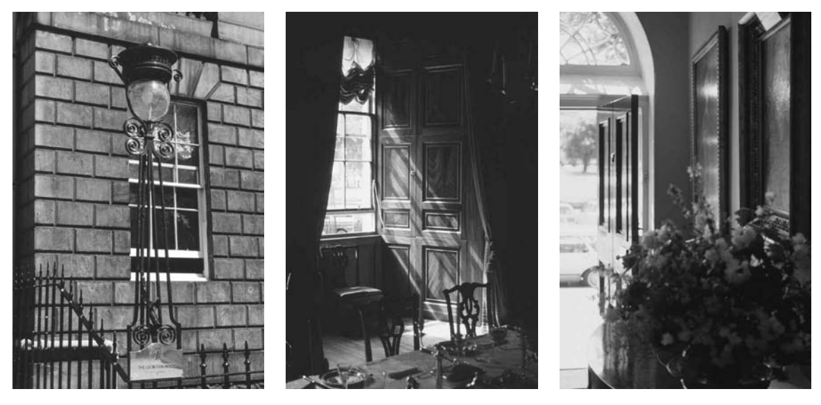
Georgian House, Edinburgh.

Inside, the window can be seen to have additional means of adjustment. Flanking wood panels open to expose collapsible shutters that filter sunlight. Drapes lower or pull aside to provide still more layers, each independently adjustable.